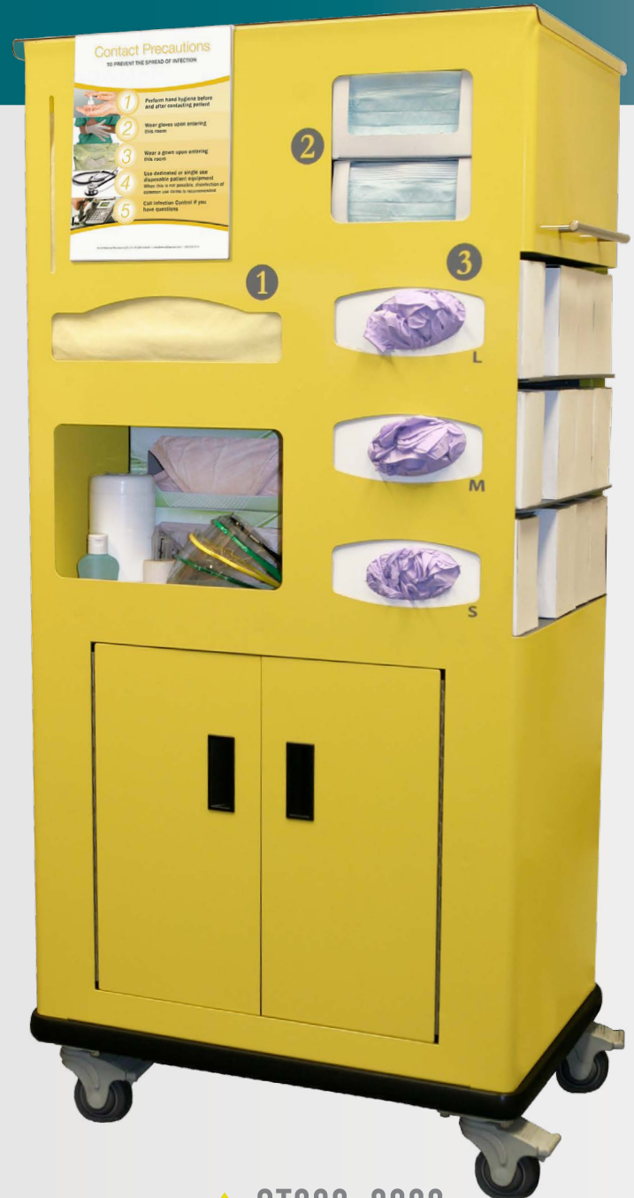
▲ CT030-0000 BOWMAN PPE CART II

CRAFTSMANSHIP AND DURABILITY: Made of yellow powder-coated aluminum with brushed nickel hardware and a 5 year limited warranty